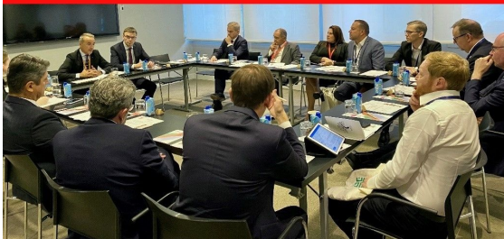
Socialists & Democrats Group meeting

S&D Parliamentarians insisted at the IPC on the importance of not falling to the “fatigue of this war”. It is clear for social democrat parliamentarians around Europe that the war may take as long as it takes, but Europeans will stand behind Ukraine . It was recalled that NATO allies have reached agreement last July, to raise the alliance's target for military spending to at least 2% of national GDP. While it is certainly hard for Socialists and Democrats to support the granting of funds to the defence industry, participants accepted that this is a part of the cost of peace. Some social democratic Members